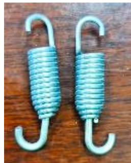
ROTAX Part no. ROT938798