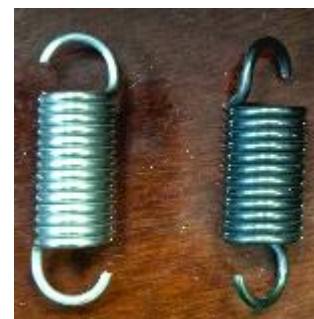
STAINLESS BLACK ROTAX Part no. ROT938796